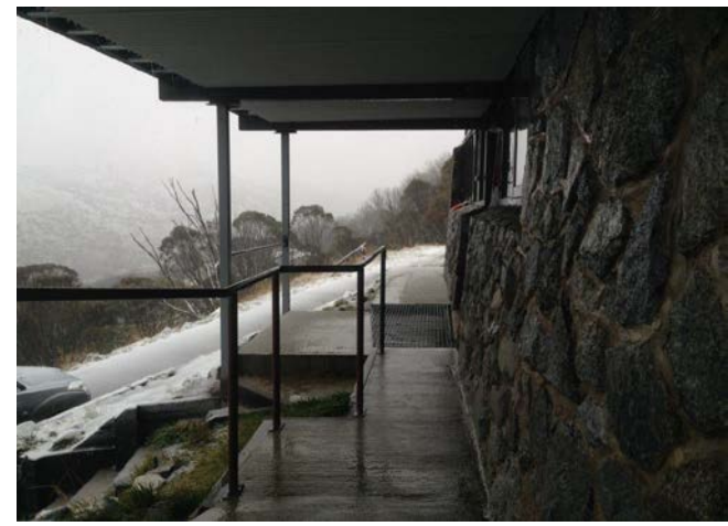
Our new front entry, May 2015

The underdeck work has basically been completed new stairs, concreting around to the wood room door - with some minor work to be done. The deck