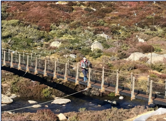
Spencer's Creek Bridge, Illawong to Charlotte Pass track