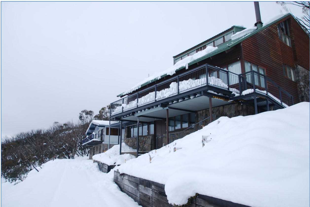
Doorack Lodge, Queen's Birthday weekend, 2021

"Through careful planning, in accordance with public health protocols, we are confident we can safely operate all three Australian resorts, all season long. We do not anticipate requiring mountain access reservations this season, but should capacity restrictions change, we will adapt our systems and update our guests."